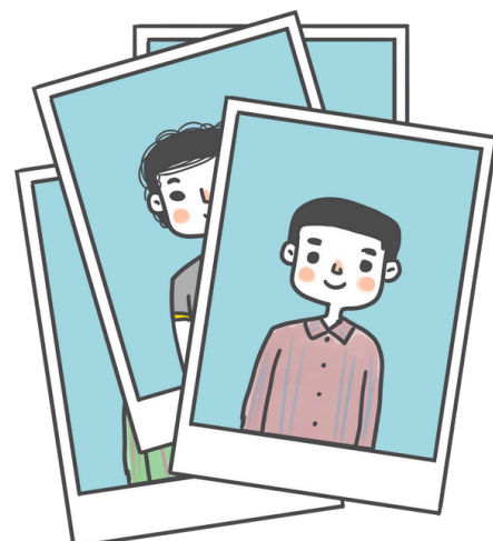
Spring Picture Days: Mar 19/20