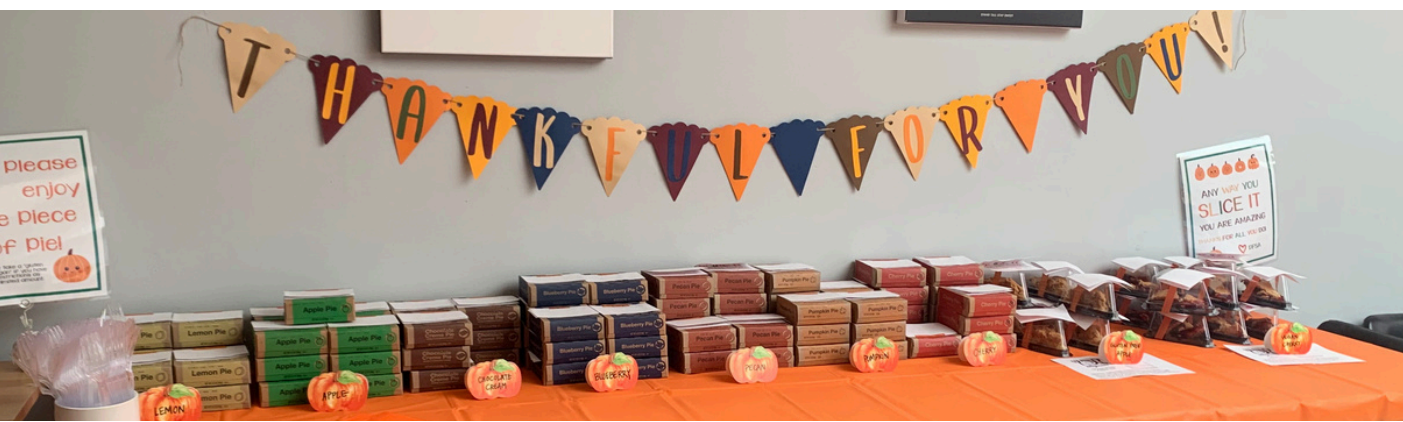
Teacher Appreciation Week: May 5-9