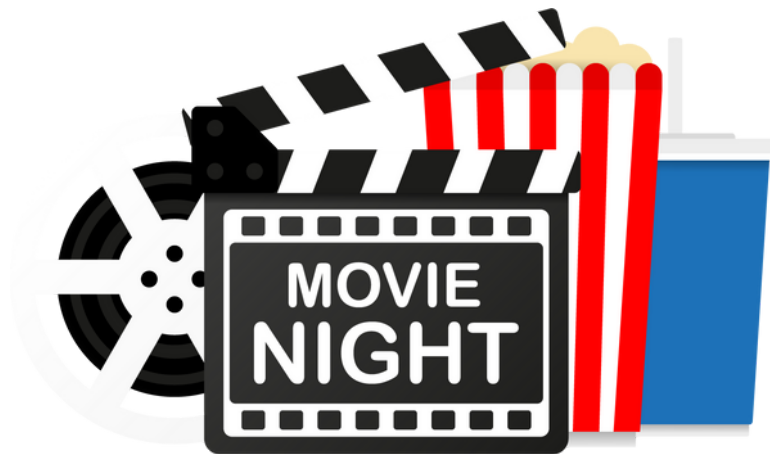
Spring Movie Night: Apr 11