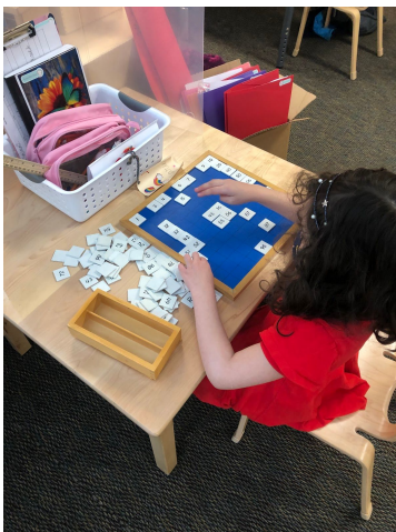
Hard work on that Montessori Hundred Board