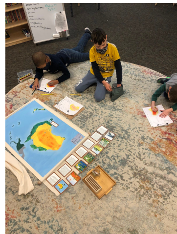
Geography exploration, safe AND collaborative