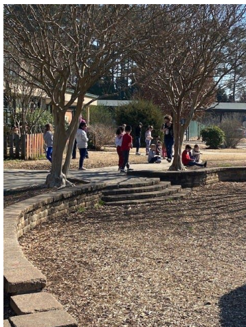
PE, Recess and Snacks in the sun!