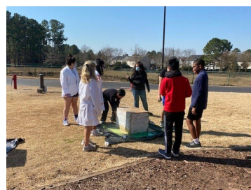
MS students preparing early for an upcoming community project.