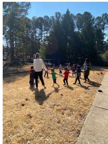
Academy students dancing and singing under the blue sky.