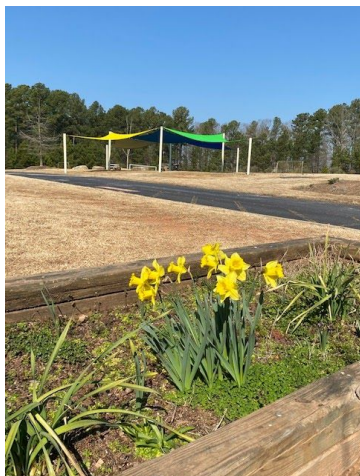
Flowers are blooming everywhere!