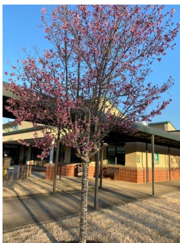
Flowers on trees -- such a lovely sight!