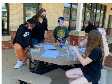
Bookbinding art projects works great in the fresh air!